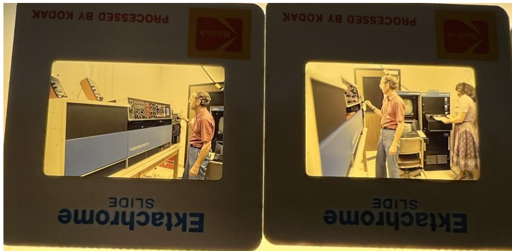
Super interesting slide set showing the installation of an early cell sorter (Ortho?!) that takes up the whole wall of a room with additional computer cabinets across from it. All this for 1 color sorting!