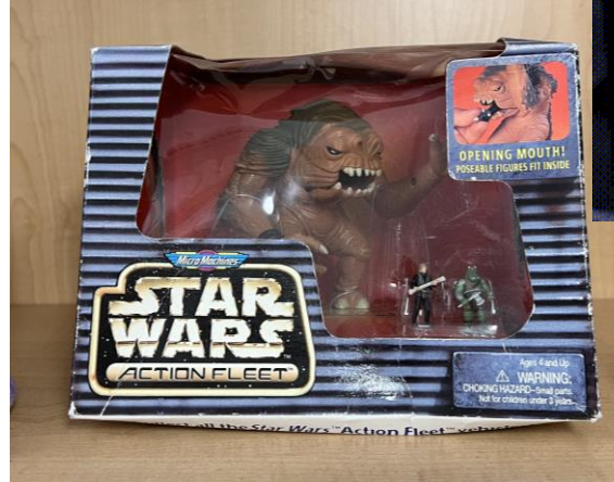
Micromachines Rancor with little Luke and Gamorrean guard.