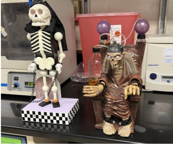
Halloween decorations – still work! - motion detector sets off horrible sounds and rattling.